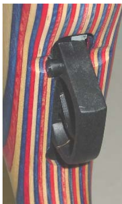
Safety engaged Daisy 888

For example, to engage the safety of a Daisy 888, it must be pushed towards the right so no red can be seen (ON Position). To fire, the safety must be pushed towards the left (the OFF position). A red marking will be visible on it, indicating the gun is ready to fire.