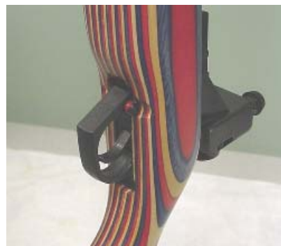
Safety disengaged Daisy 888 Red line is visible.

Keep the safety engaged until ready to shoot.